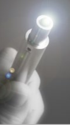
connects the FR12 projection head up to 30 metres away.

installations such as compact control rooms and other 24/7 installations, or even small post production suites, and its light weight design makes the FR12 ideal for motion platforms and other simulators where access to traditional projectors is limited.