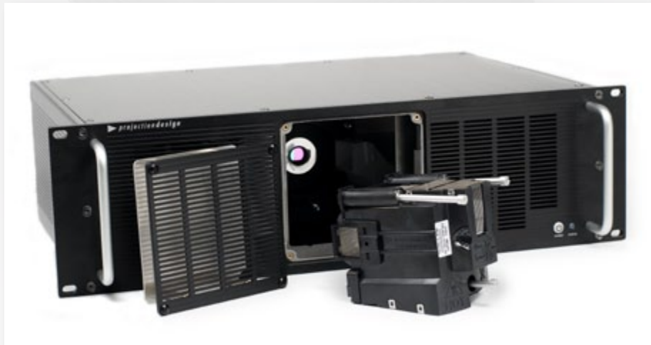
The Remote Light Source is rack mountable, and can be installed in a standard rack up to 30 metres away from the projection head.

The projectiondesign FR12 RLS™ series of projectors is truly revolutionary. Building upon the successful F12 series projectors, the FR12 RLS employs the new Remote Light Source technology to remove the lamp from the projector, creating a near-silent projection head that can be used in a range of applications with noise-free operation and simplified maintenance.