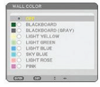
On a green wall...

These provide for adaptive color tone correction to display properly on non-white surfaces.