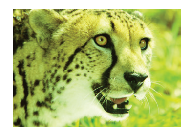
BEFORE auto wall correction