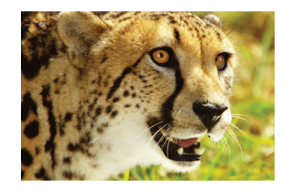
AFTER auto wall correction